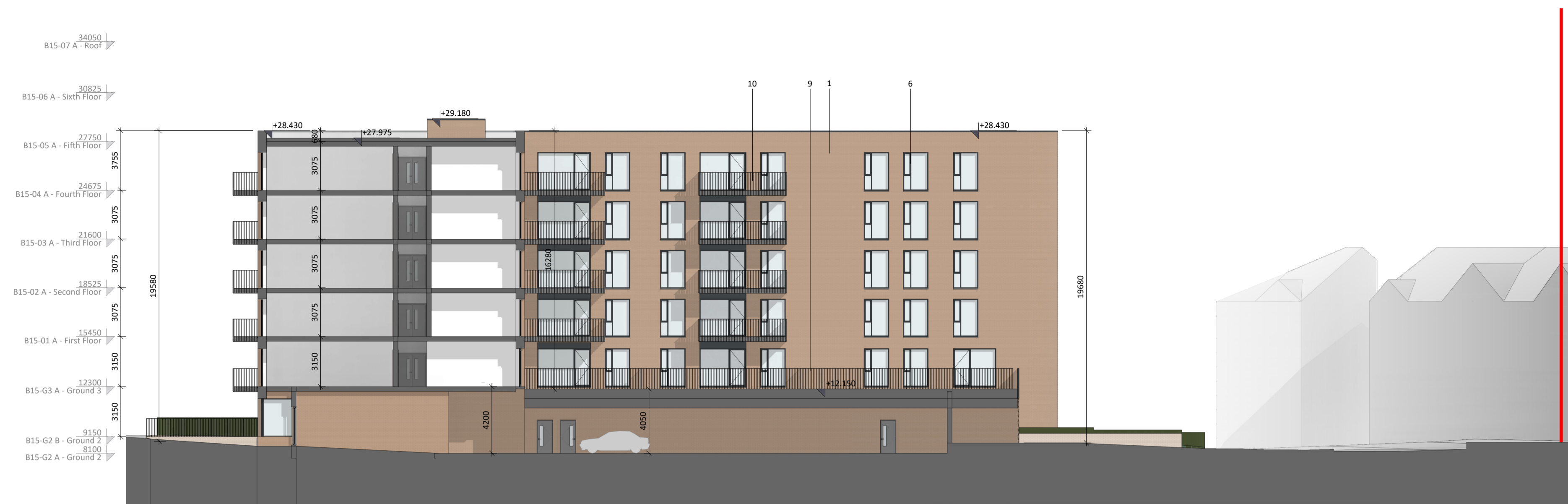
1 B15 Section C-C 1:200