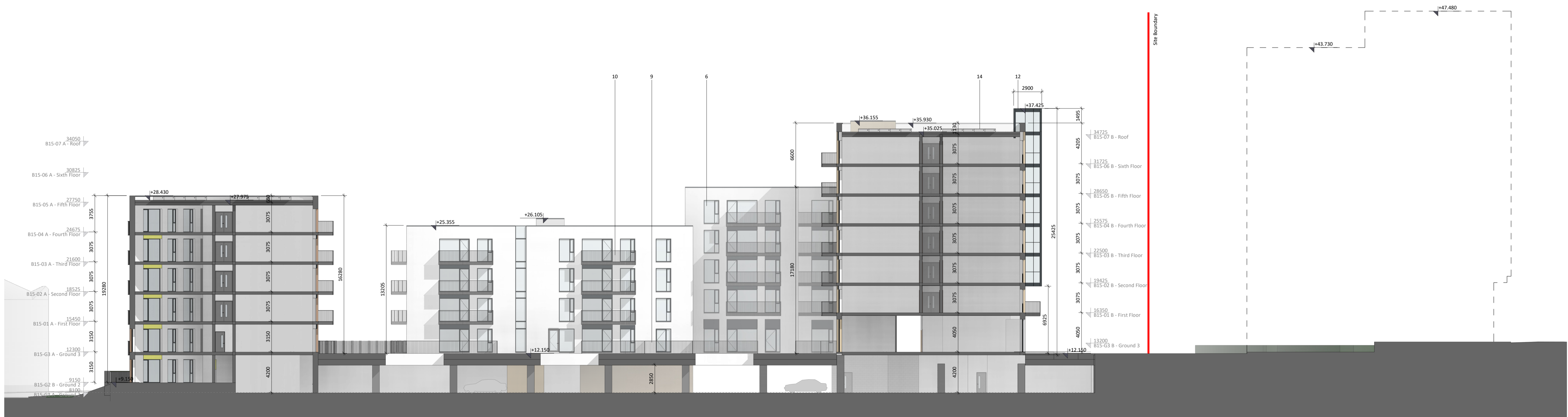
2 B15 Section D-D 1:200

Block 16, development subject to separate planning application ref: 22/40809